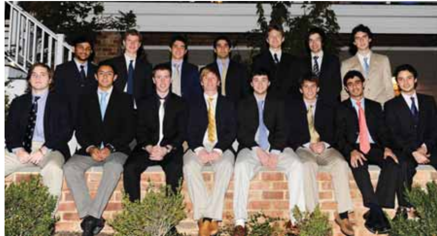
Celebrating its 39th year, the Price-Bullington Invitational Squash Tournament is the longest running amateur squash invitational in the United States

October 30 th – November 1 st The Country Club of Virginia