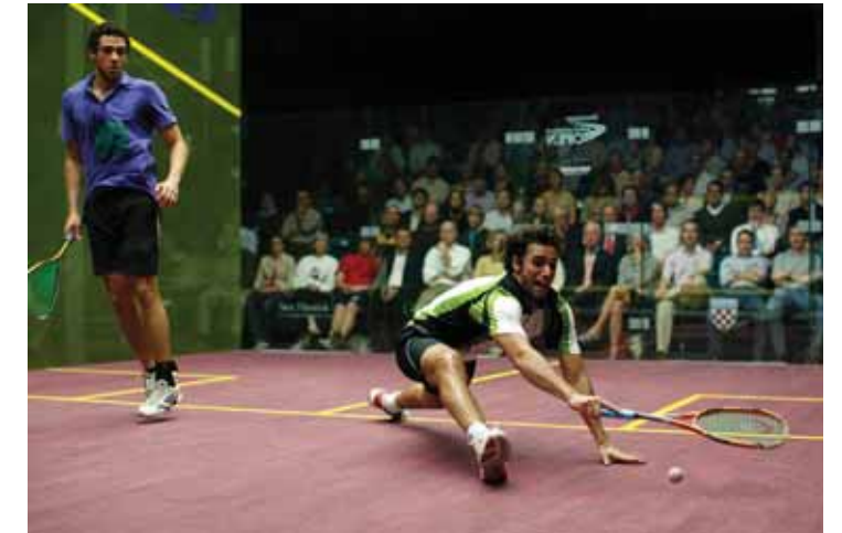
2010 North American Open is a PSA Super Series Event

The University of Richmond and The Country Club of Virginia